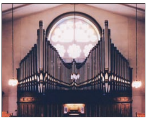
Guilbault-Thérien Pipe Organ, 1988 Saint-François-d'Assise Church, Ottawa Opus 28, 2 manual + pedal, 31 stops

Stop lists from 1886 and 1915 were completely revised and 40% of the